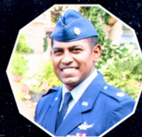
CAMP SPEAKER Lt. Col. Moses George (United States Space Force)